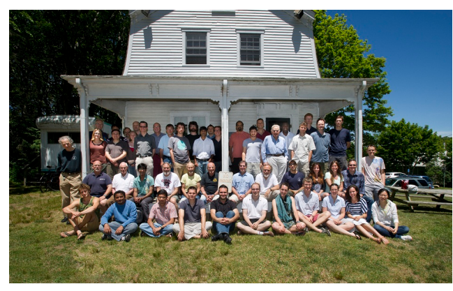
The 2012 GFD Photograph.