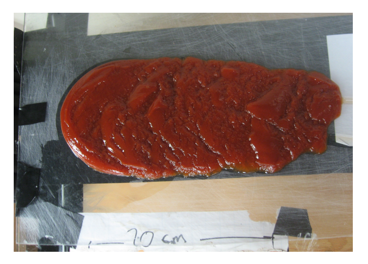
Duncan found that ketchup flowed more slowly down a slope the longer one let it rest before tilting

Week 2: Edgar Knobloch Spatially localized structures: Theory & applications